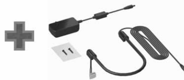
ADA1015P Hardwire Kit