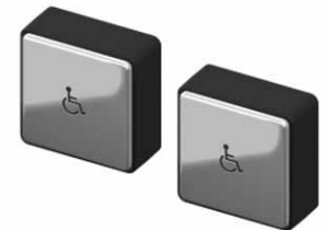
Square Style Push Buttons (2)