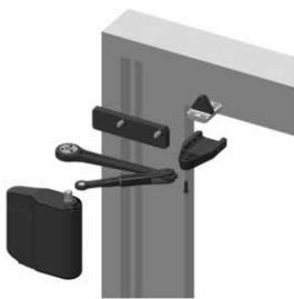
Push Side – Parallel Arm Black Cover - Standard