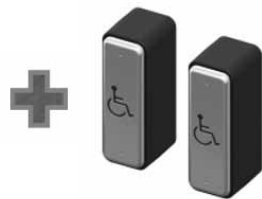
Narrow Style Push Buttons (2)