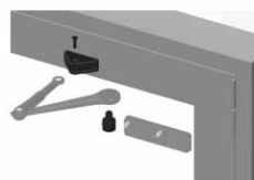
Pull Side – Regular Arm